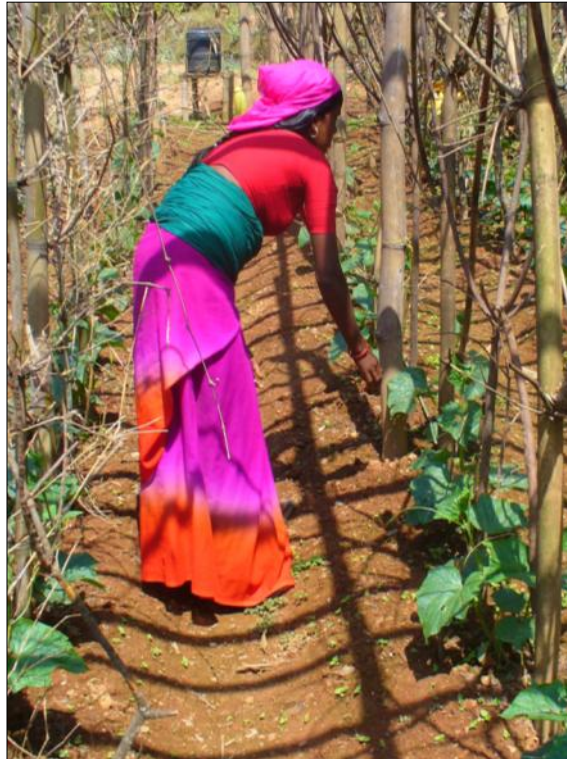
A SIMI project participant tends to her squash. In the background, a small water tank provides water to a simple drip irrigation system.

These positive results are in keeping with those of other multiple-use schemes. According to a Bill and Melinda Gates Foundation study that looked at multiple-use schemes in 10 African and Asian countries, once basic domestic needs are met (approximately 20 liters per person per day), each additional liter per day generates an estimated US $.5-$1 per year of income. Increasing the water available for a family of five from 20 to 100 liters per person per day can mean an added US $200-$400 in annual household income.