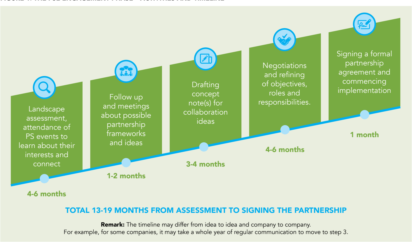
FIGURE 1: THE PSE ENGAGEMENT PHASE - ACTIVITIES AND TIMELINE

According to the interviewees, it is good to be aware that, although the initial discussions with a company may appear promising, and even after months of communication with the company that is interested in CTIP, the collaboration may never come to fruition.