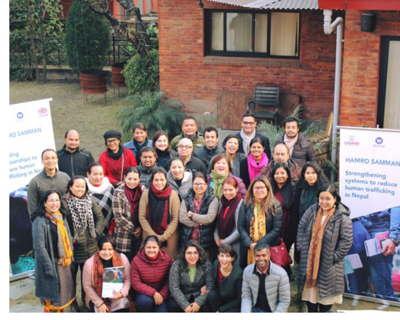
Picture 1: Jivika's approach will cater to their needs and interests of the target group, while also drawing on market-driven approaches and training models to build sustainable partnerships and solutions.

Jivika partners will provide life skills training and psychosocial support along with market-aligned vocational training to ensure equal opportunity for the most vulnerable individuals. For candidates interested in entrepreneurship, there are trainings and linkages with support services to enable start-ups. Jivika implementers will collaborate with Hamro Samman's shelter and CSO partners and other local-market stakeholders such as GoN Employment Service Centers to source and screen viable, interested candidates.