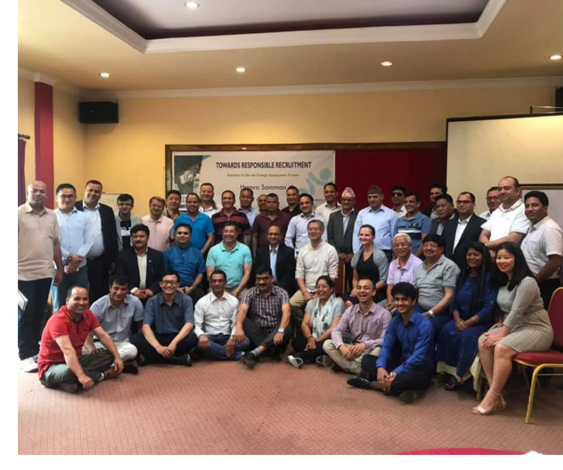
Picture 3: NBI convened the National Association for Foreign Employment Agencies and its members to discuss solutions with Government representatives of relevant ministries and departments

The Ministry of Women, Children and Senior Citizens (MOWCSC) manages an Online Service Directory that lists a range of services available from government entities and CSOs in 16 districts. A more comprehensive and accessible referral system at the national, provincial or local level that interfaces with various actor, and brings the private sector, CSO and GON services in the same platform, can provide a reliable need-based service to survivors and their families and enable more effective recovery and reintegration as well as aid protection and prevention of trafficking. This referral system is envisioned as a digital platform that facilitates secure and prompt cross-sectional information-sharing for stakeholders involved in rescue, rehabilitation and reintegration of survivors. The referral system may ultimately be owned and managed by the government or a suitable CSO or business network to ensure sustainability.