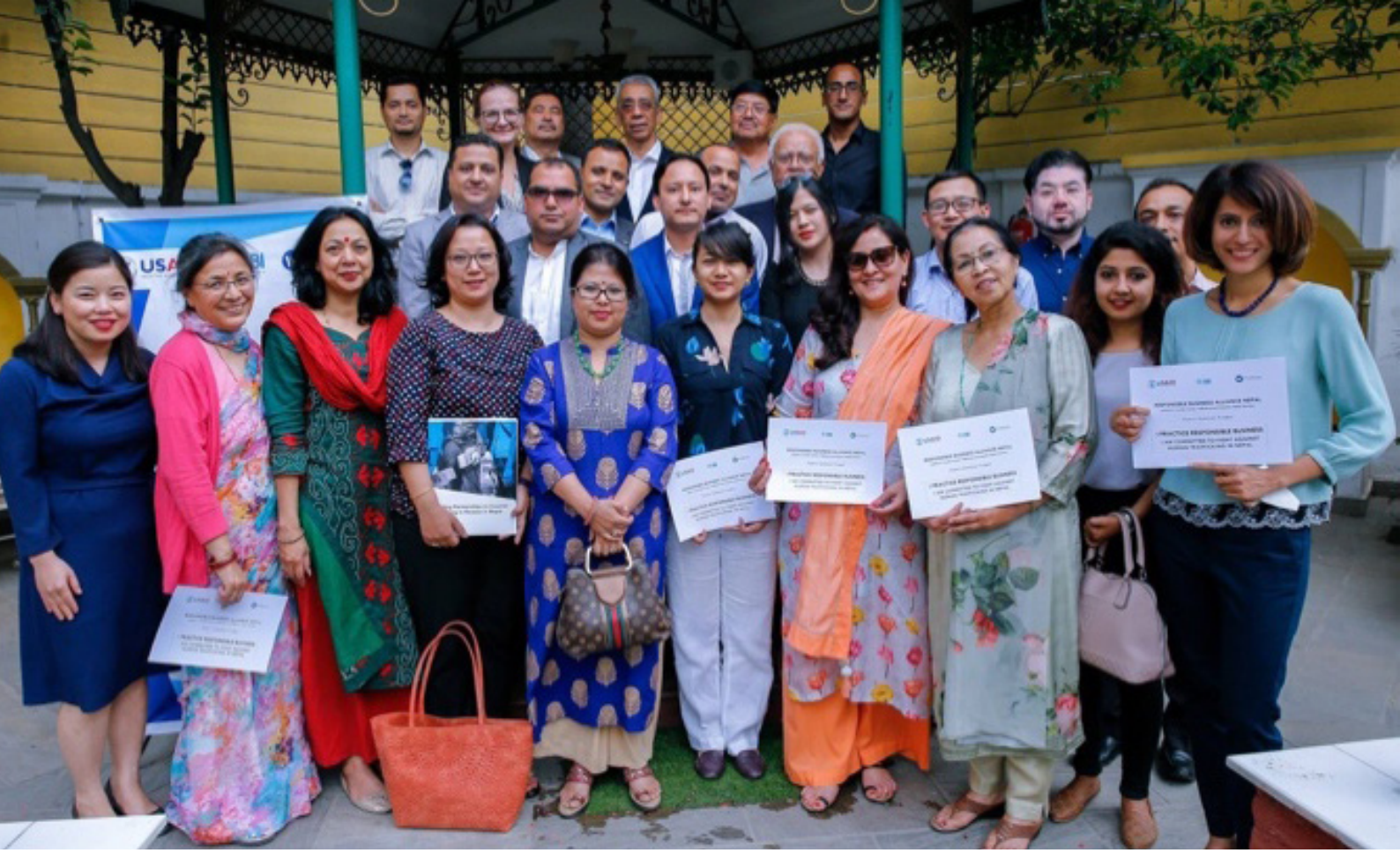
Picture 4: Convening of progressive business leaders to establish a multi-sectoral Responsible Business Alliance Nepal

In line with the recommendations from the 2019 Bali Process, the Alliance adopted the AAA Framework — Acknowledge the problem, Act to strengthen and implement practices and policies, and Advance efforts as their model of engagement.