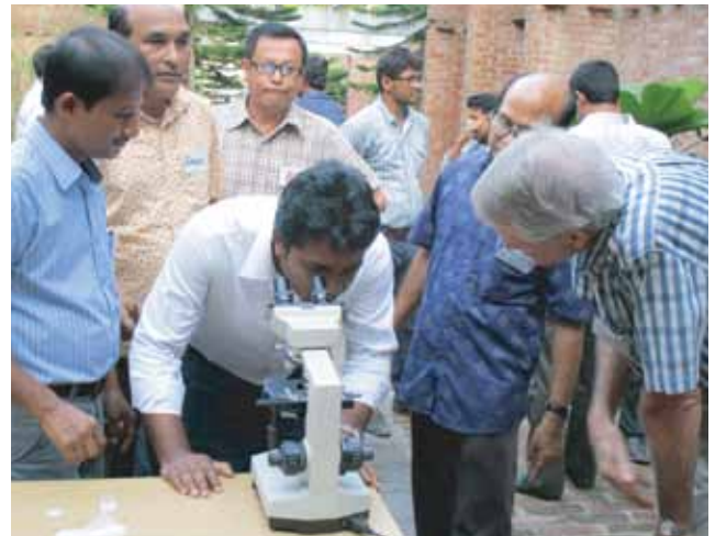
Practical training session

The aim of the ToT course was to develop confident, competent SAFETI team members with the skills and knowledge on technical methodologies for semi-intensive shrimp and prawn farming, as well as training and extension skills.