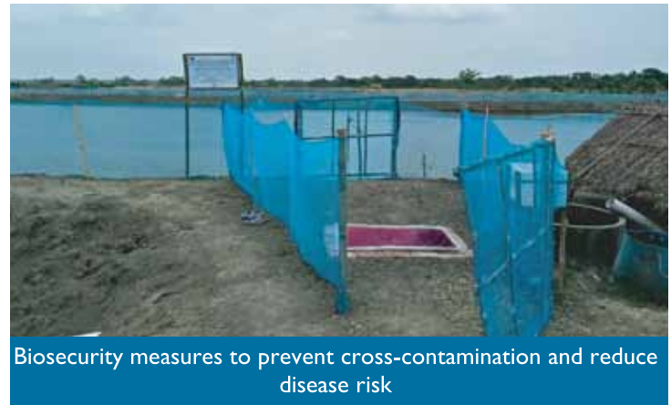
Biosecurity measures to prevent cross-contamination and reduce disease risk