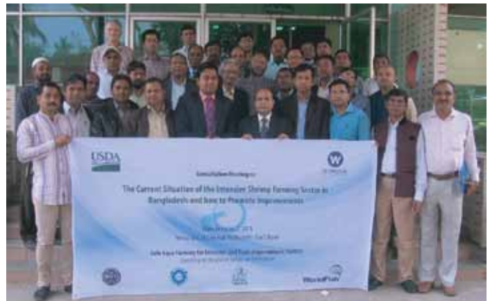
Consultation meetings at Khulna (left) and Cox’s Bazar (right)