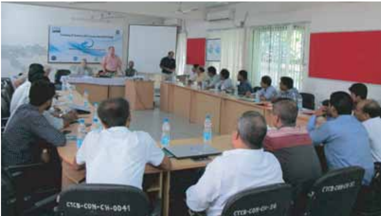
Inauguration speech by COP

Capacity building of project staff is a vital step for any organization that aims at effective and efficient project delivery. SAFETI technical project staff need two separate sets of skills and knowledge. First, they need to have the technical understanding of the subject matter; second, they need to know how to transfer that technical knowledge to the farmer.