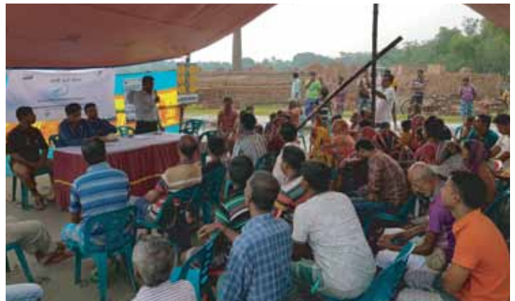
Participants at SAFETI organized Farmer Field Day

During September 12-30, 2018, SAFETI organized 25 Farmer Field Days (FFD) to disseminate technology to an expanded group of farmers. The 6 Key Steps of SAFETI-promoted farming methodology were discussed and successful demonstration results were viewed by the participants which included DoF officials, feed and other input suppliers, and farmers. 353 similar FFDs will be held in the coming months.