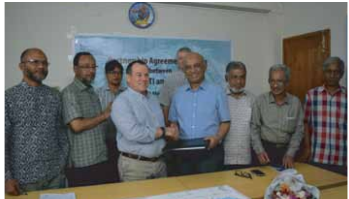
Partnership agreement signing between SAFETI and BSFF

TMSS, a Bangladeshi NGO operating nationwide, was founded in 1980, and has been implementing fisheries development projects since that time in southern districts of Bangladesh. The SAFETI-TMSS partnership agreement was signed on July 9, 2017.