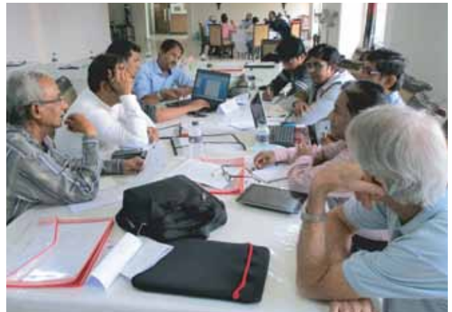
Participants discussing at consultation meeting

The USDA SAFETI project organized a two-day consultation meeting on the “Current Situation of Freshwater Prawn Hatchery Operations and Way Forward” during November 27-28, 2017 at Kuakata, Patuakhali. Twenty-eight participants, including freshwater prawn hatchery owners, technicians, scientists, experts from universities and professionals from national and international institutions took part in the meeting. The major issues identified were: quality of inputs, larval mortalities of unknown cause, a need for healthy and disease free broodstock and a lack of expert manpower. To overcome these challenges, the participants recommended: (1) ensure all hatchery inputs are by a legal importer and ensure quality by government testing; (2) identify the underlying causes of the larval problems through a well-designed epidemiological study; (3) ensure disease free broodstock, ideally Specific Pathogen Free (SPF); and (4) develop a well trained cadre having relevant educational backgrounds, e.g., in fisheries.