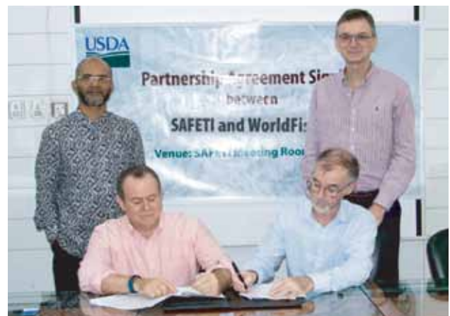
Partnership agreement signing with WorldFish

WorldFish is an international, nonprofit research organization that harnesses the potential of fisheries and aquaculture to strengthen livelihoods and improve food and nutrition security. As a SAFETI technical partner, WorldFish will help in the areas of shrimp and prawn disease diagnostics and surveillance. SAFETI and WorldFish signed a partnership agreement on October 26, 2017.