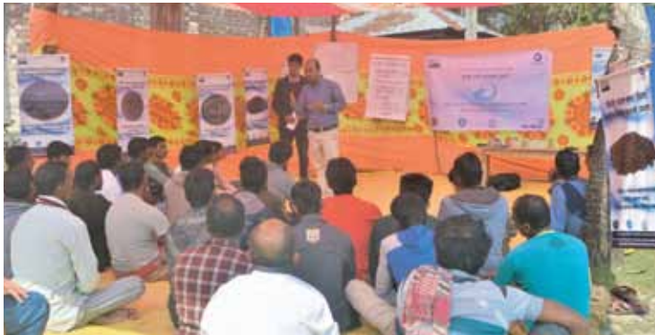
Farmers' Training on Bagda-Golda rotational farming

9,420 farmers in 380 clusters were trained in semi-intensive shrimp farming, shrimp-prawn rotational farming and prawn-carp polyculture farming. The training comprised three modules: Module I-pond preparation, PL stocking, income-expenditure and record keeping; Module II-post stocking management, feeding, water quality, health management; and Module III-postharvest management, sanitary and phytosanitary standards.