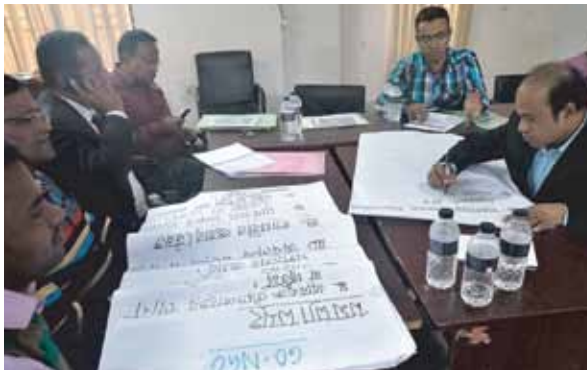
Group exercise at consultation meeting

The USDA SAFETI project organized a stakeholders' consultation meeting on “Freshwater Prawn and Shrimp Farming” in Patuakhali, in the southern part of Bangladesh on November 29, 2017. Thirty-five participants including various value-chain actors including shrimp and prawn farmers, private and public sector representatives attended the meeting. The meeting was organized to analyse the existing situation of shrimp/prawn farming in this region and to assess future prospects for undertaking activities with SAFETI or other development projects.