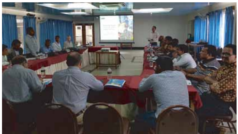
Question and Answer session at consultation meeting

The SAFETI project organized a consultation meeting on the “Shrimp and Prawn Feed Sector” on March 11, 2018 in Khulna to understand the capacity and needs of agro-dealers and other input suppliers. The objective of this meeting was to discuss and understand the current status of the Shrimp and Prawn Feed Sector, including current market trends, quantity sold, consumption patterns, and to identify the constraints and the potential of the feed sector. Representatives of seven leading feed companies attended and took part in the consultation process along with BSFF, WorldFish representatives and SAFETI staff. In the meeting, market trends, technical extension services and possible collaboration opportunities with the SAFETI project were discussed.