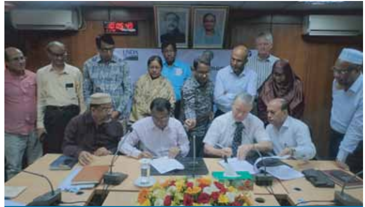
The MoU signing ceremony

Subsequently, a Project Technical Committee was formed under the auspices of the MOU to guide and monitor the implementation of the activities that will be undertaken jointly by DoF and SAFETI.