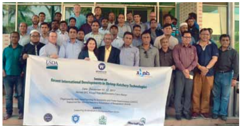
Participants of the seminar

Thirty-three participants including professionals from the public sector, and technicians, consultants and owners of bagda hatcheries participated in three mornings of presentations by national and international experts on the latest technologies in shrimp hatchery production around the world. Experts from Europe, India, Philippines, Thailand, USA and Vietnam gave updates on improvements in operating methods that could be of value to Bangladesh. The seminar resulted in a compendium of information and best practices in hatchery technology.