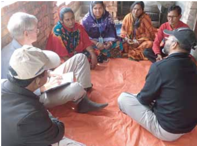
Discussion with the farmers for baseline information

The most instructive finding of the baseline survey was that low productivity is the key issue affecting the entire shrimp/prawn sector, including the profitability of farmers and of many upstream and downstream actors. The baseline survey