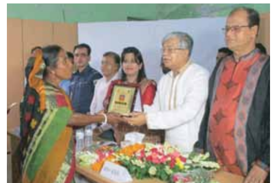
SAFETI farmer receiving “Best Woman Shrimp Farmer” award

National Fish Week is a major annual event organized by the Department of Fisheries (DoF), Bangladesh where the Government, private sector and development partners showcase innovation, activities and development in the aquaculture and fisheries sector. The USDA SAFETI project of Winrock International participated in different events during this year’s “National Fish Week – 2018” in Dhaka and in districts where SAFETI is implementing activities. In Dhaka, SAFETI set-up a display booth for the Fish Week Fair which received an award in the “Development Partners” category. Six SAFETI-supported farmers received awards for “Best Shrimp Farmer 2018” for outstanding shrimp production in their region.