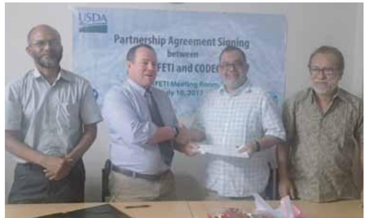
Partnership agreement signing with TMSS (left) and CODEC (right)

CODEC is another implementing partner of SAFETI, and has been working as a people-centered development organization since 1985 in the Chattogram Division and in southern areas of Bangladesh. The SAFETI-CODEC partnership agreement was signed on July 10, 2017.