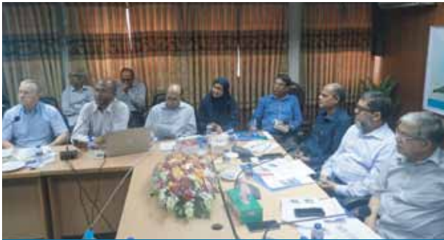
SAFETI DCOP presenting the keynote paper

BFEEA, SHAB, intensive shrimp/prawn farmers, hatchery owners, experts and private sector representatives attended the seminar.