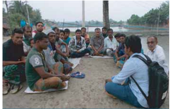
Farmers' meeting adjacent to a SAFETI selected gher area

The SAFETI extension staff organized informal meetings in the selected villages and discussed the project's objectives, and technologies. These meetings were followed by individual meetings with the candidate farmers to collect information on their resources and willingness to participate in the project. Based on the farmer's interest in adopting and investing in improved shrimp farming methodologies developed and promoted by SAFETI, 9,500 farmers were selected in 10 upazilas, in line with the Year 2 project target. These farmers are grouped in 380 clusters with 25 farmers in each cluster, and they will receive training and regular technical support from SAFETI.