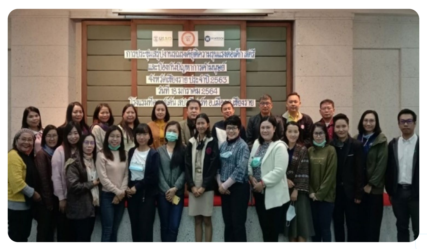
Figure 4: The CCT group and provincial stakeholders met in Chiang Rai to review the outcome of the Campaign to End Violence Against Women, Children and Trafficking.