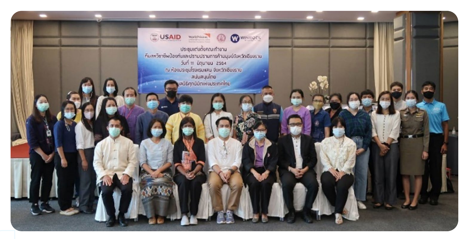
Figure 1: CCT members and Local Government officials are appointed to an MDT working group roster, appointed by the Chiang Rai Governor

Under the USAID Thailand CTIP project, between 2018-2021, Implementing Partner World Vision worked with local partners in Chiang Rai Province to establish The Committee for the Coordination of CSOs for Protection of Children, Women and Counter Trafficking in Persons in Chiang Rai Province (CCT). Chiang Rai province is home to over 30 civil society organizations working with vulnerable groups, including ethnic minorities, stateless people, migrant workers, women and children. Previously, there was limited coordination between these organizations, with organizations working only with preferred or established partners, despite the fact that many organizations had similar goals, objectives and served the same target groups, often in the same locations. In 2018, World Vision initiated discussions with other NGOs in Chiang Rai to propose the establishment of a committee to strengthen coordination and