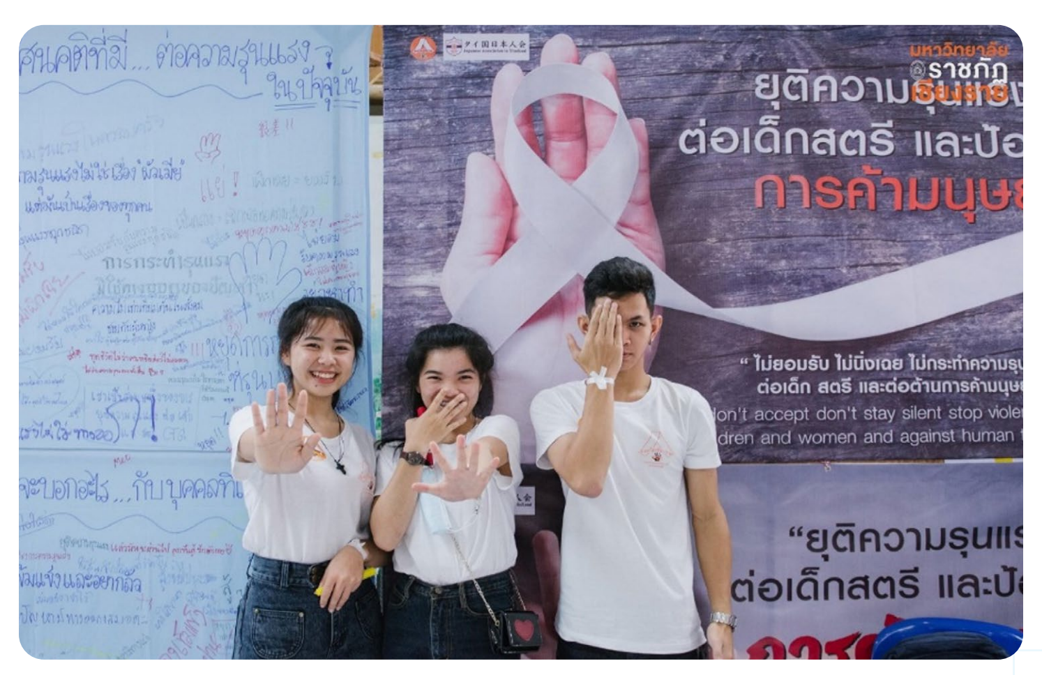
Figure 3: Youth participants interact in an End Human Trafficking Campaign, managed, and organized by the CCT in Chiang Rai