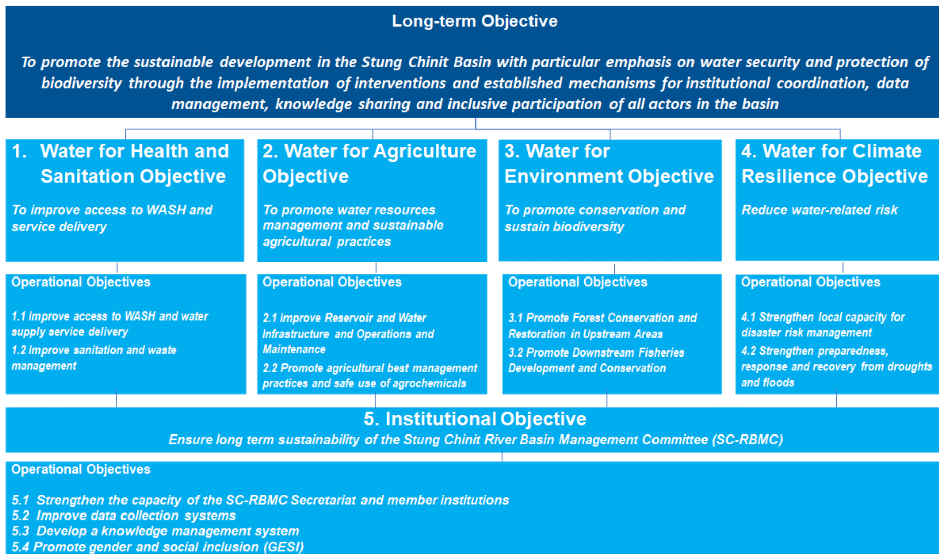
Figure 3: Strategic Action Plan Objectives