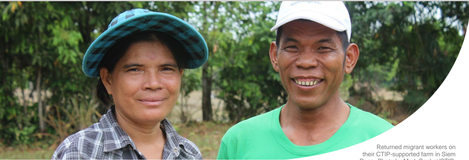
Returned migrant workers on their CTIP-supported farm in Siem Reap.