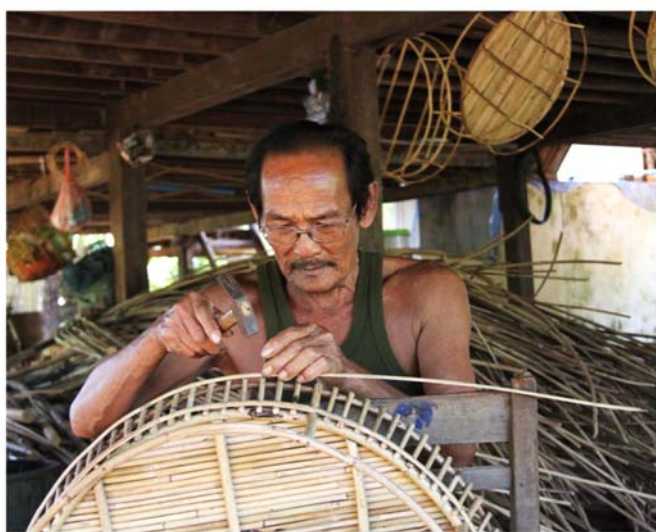
Thong An builds and sells traditional Cambodian furniture and other useful products from locally source wild rattan.

"We thank USAID for their assistance. Our community members are continuing to collect non-timber forest products, and several report seeing more wildlife in our forest, including the wild Banteng. These are good indicators for us. This is what we want to see."