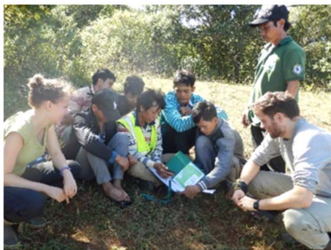
Gibbon researchers work with local tourist guides to understand how to use GPS units.