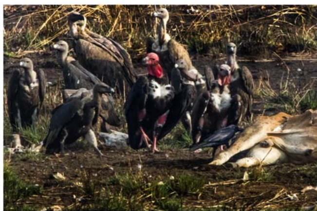
A group of endangered vultures photographed at the feeding center.

The USAID Supporting Forests and Biodiversity Project assists Cambodian communities to conserve biodiversity and generate income through ecotourism.