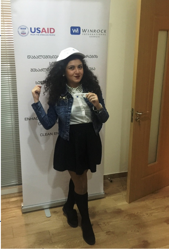
EC-LEDS Facebook Contest Winner Tako Kobakhidze