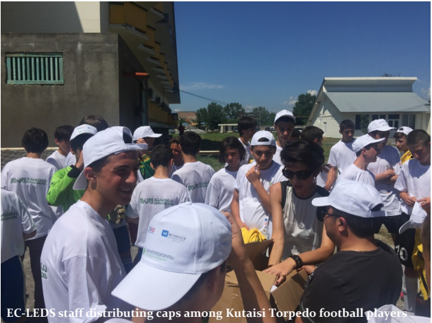
EC-LEDS staff distributing caps among Kutaisi Torpedo football players