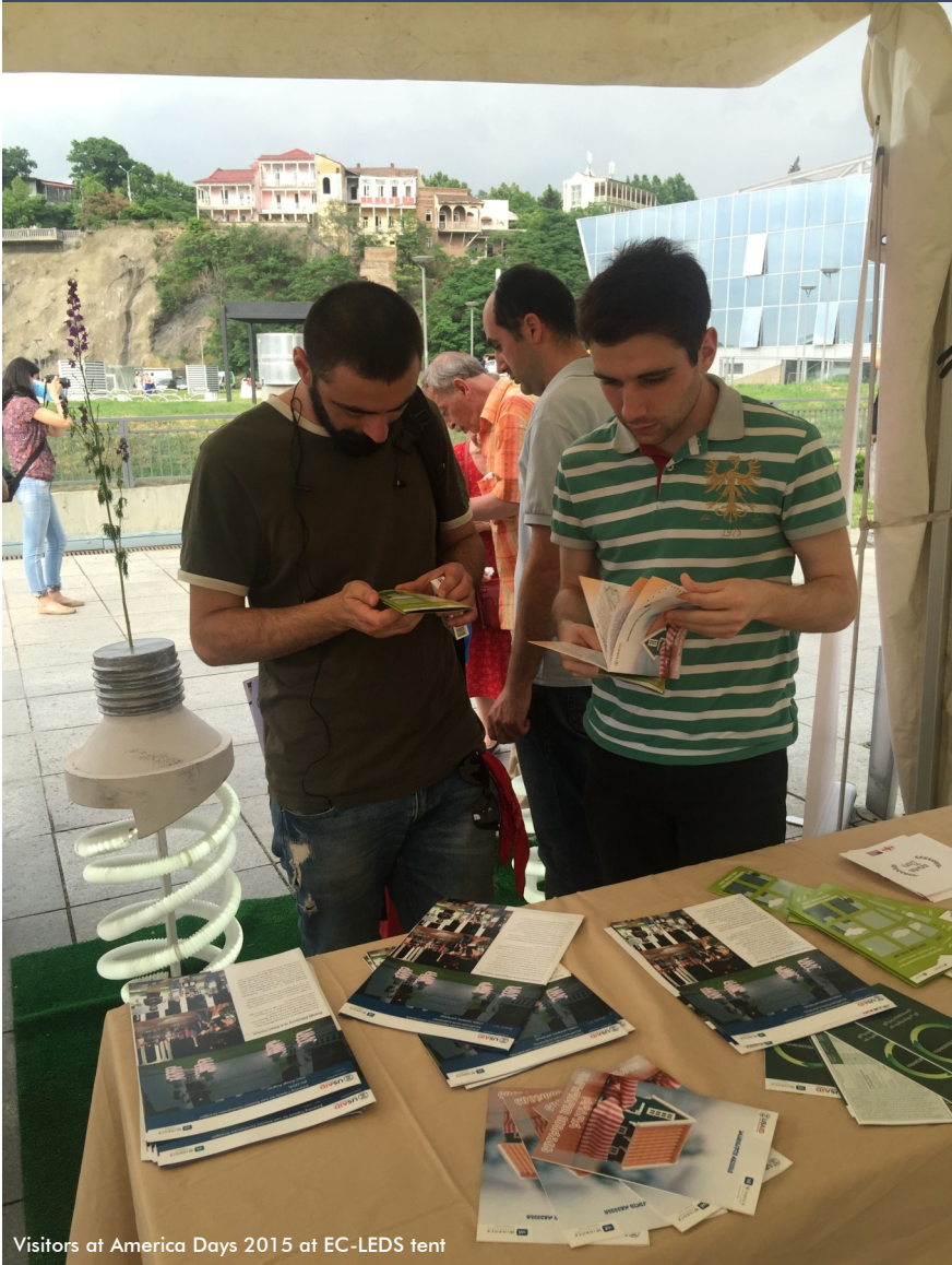
Visitors at America Days 2015 at EC-LEDS tent

From June 1 to 6 the U.S. Embassy celebrated America Days to showcase American culture and U.S.-supported programs in four Georgian cities - Zugdidi, Akhaltsikhe, Gori and Tbilisi.