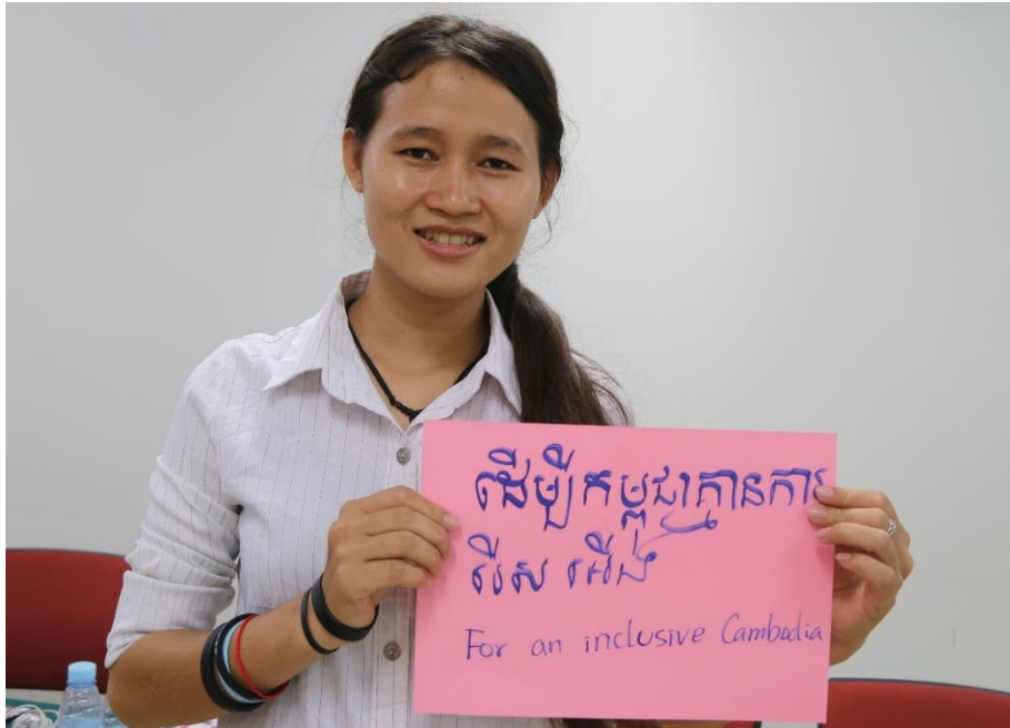
A participant at the Gender and Social Inclusion Workshop

There were low levels of understanding around social discrimination or belief that it is unjust among the general public (and thus among staff and managers of CTIP). Cambodia is a socially conservative, traditional society. Three days of workshops in which people have an opportunity to reflect on social inequalities and listen to advocates from various discriminated or minority groups engaged people and changed attitudes to an extent (e.g. “I would have beaten either of my siblings if they told me they were gay before, but now I realize its natural and I’d tell other people to let them be”, said one participant.) However, this is just a first step. Changes of attitude and behaviors that are deeply rooted in a culture take time, and not everyone will have the desire to question their beliefs