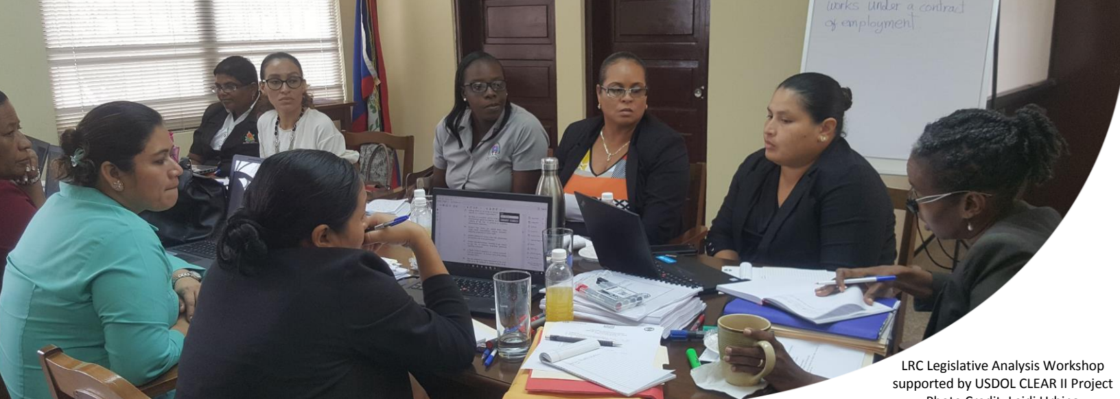
LRC Legislative Analysis Workshop supported by USDOL CLEAR II Project