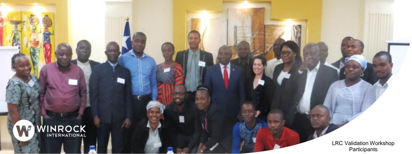
LRC Validation Workshop Participants