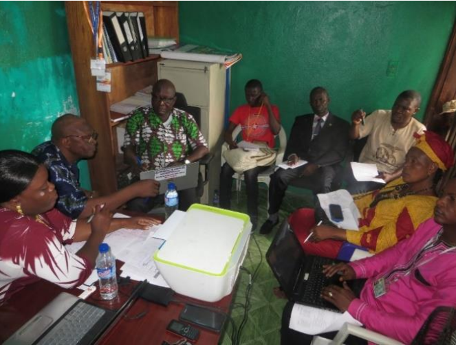
Members of the LRC review the draft Hazardous Work List and Light Work List ahead of the validation workshop in NACOMAL's office at the Ministry of Labor.

Legislative reform for child labor issues is a strong priority for the Liberian government. Through collaboration with the CLEAR II project, the National Commission on Child Labor in Liberia (NACOMAL) has established a Legislative Reform Committee (LRC) is to review and analyze child labor laws to make recommendations for reform and support advocacy to the Liberian legislature for the validation of policy.