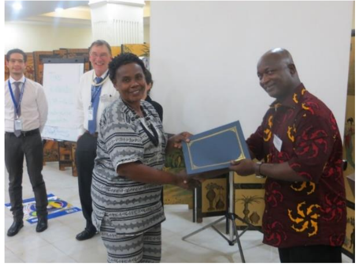
An Assistant Minister presents a certificate to an LRC member for completing a Child Labor Regulation Workshop. LRC members include government officials and representatives from civil society.

As a government structure, the LRC is motivated by the participation and supervision of NACOMAL in the Ministry of Labor, as well as participation from members of Parliament responsible for labor issues, including child labor. Currently, the Ministry of Labor through NACOMAL hosts LRC meetings independently to discuss and analyze children’s laws.