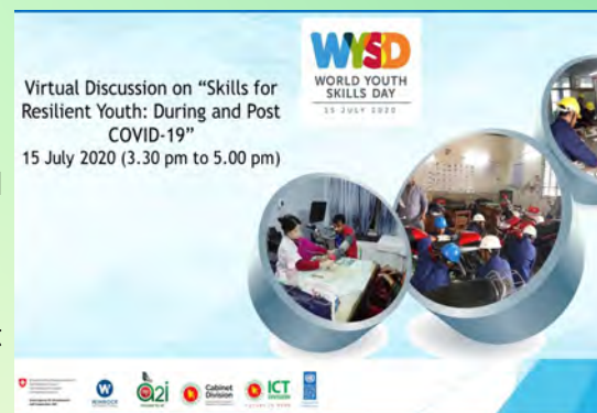
Ashshash observed the World Youth Skills Day 2020 through organizing a webinar

On July 15, 2020, the Ashshash Project, in collaboration with Future of Work Lab, a2i, organized a virtual webinar on “Skills for Resilient Youth: During and Post COVID-19” to observe World Youth Skills Day. Representatives from government agencies, development partners, UN agencies, national and international organizations, and local TVET institutes participated and shared their valuable views. The session emphasized on the importance of soft/life skills as well as psychosocial counseling for the youth during COVID-19 situation. Panelists also shared that online based skills development training can be a possible alternative during and post COVID-19 crisis. Discussions explored possible avenues and alternatives in economic empowerment to prepare and assist young beneficiaries to move towards sustainable economic reintegration, while navigating challenges during and post COVID-19.