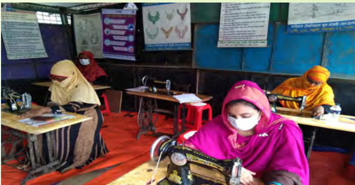
Ashshash beneficiaries during a class of Tailoring and Dress Making course