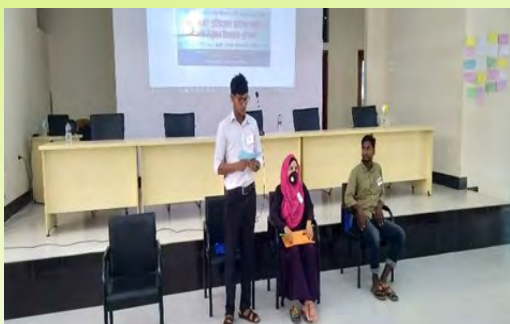
One of the Ashshash's CTIP Activists sharing his opinion during the CTIP Activists Capacity Development Training.

Ashshash has formed Counter Trafficking in Persons (CTIP) activist groups in its five focused districts- Satkhira, Khulna, Jashore, Chattogram, and Cox's