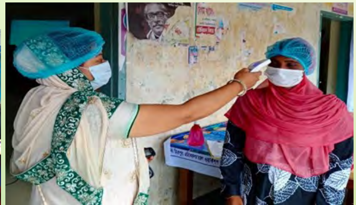
Health guidelines were strictly followed during all the training sessions