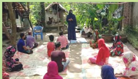
Ashshash's community counseling services in Kaliganj, Satkhira district.

of the community towards survivors and ensuring that they become aware about trafficking, as well as showing respect to survivors. A few survivors shared that Ashshash is bringing behavioral change in the community, which has improved their condition in the society.