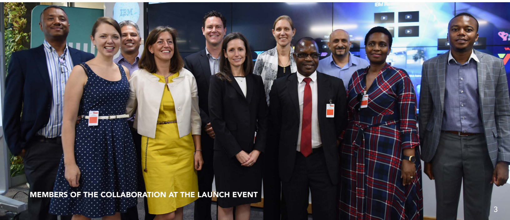
MEMBERS OF THE COLLABORATION AT THE LAUNCH EVENT