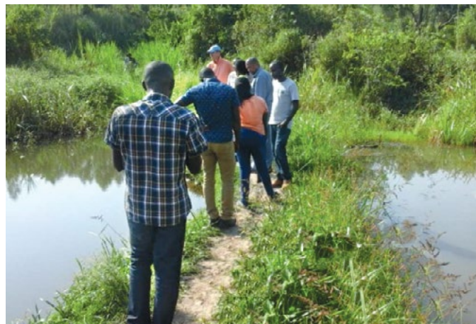
Kizikibi Wetland before (left) and after (right) restoration activities.