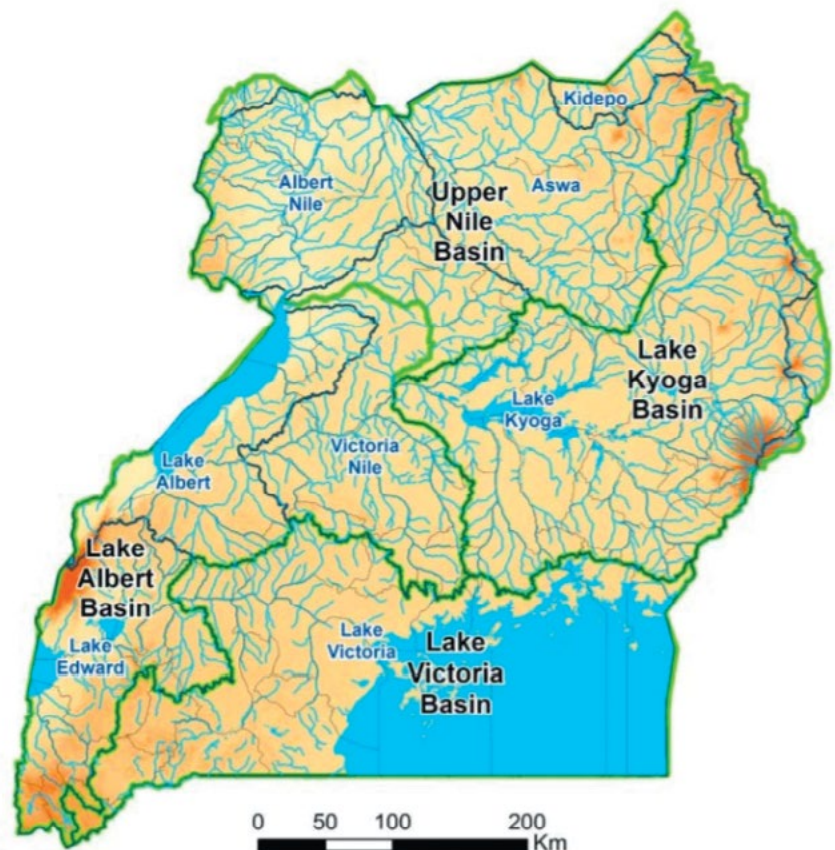
FIGURE 1: MAP OF UGANDA SHOWING THE 4 MAJOR BASINS ON WHOSE HYDROLOGICAL FLOW THE ALBERT, VICTORIA, UPPER NILE, AND KYOGA WATER MANAGEMENT ZONES DELINEATION IS BASED

Prior to Water For People's intervention in Kamwenge District 2013, there was severe degradation of wetlands in Biguli. The degraded ecosystems were within the recharge areas of the existing and planned piped water supply systems, which posed a significant threat to the reliability and sustainability of the systems that depend on groundwater. The wetlands were degraded through human activities, mainly crop agriculture, brick-making, sand-mining, and forestry, with water-draining tree species, such as eucalyptus, that were planted and thriving in the fragile ecosystems. Safe water coverage in Biguli was only at 23% because handpumps installed by the district had failed; they required better technologies since the water table was too low to support shallow wells.