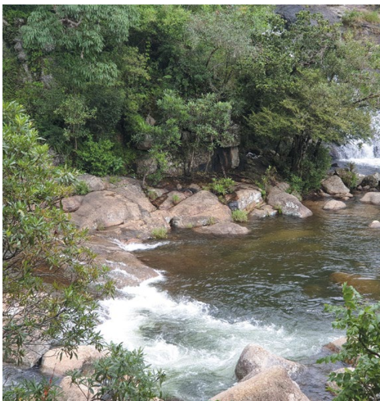
Stream running in the source watershed, Mulanje Mountain Forest Reserve.

Taken as a whole, the challenges that have been or continue to be experienced are minor compared with the compelling opportunity to address the bigger challenge of degrading water sources, which requires collective action. It is clear that no one organization could achieve the desired outcome of the water fund without its reliance on the others, one of the key lessons learned.