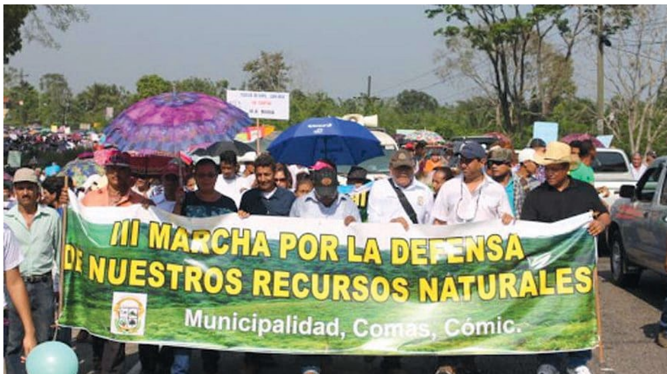
A march to promote the protection of microwatersheds in El Negrito, Honduras, with participants from local institutions, civil society, and municipal officials.

The degradation of water sources in this municipality is becoming more and more noticeable. The 2015 water inventory conducted in the municipality found that about 46% of the microwatersheds faced numerous threats, including agriculture, livestock, coffee farming, and some human settlements. These land uses degrade water quality through erosion, dumping of debris, and the use of chemicals, such as herbicides and fertilizers.