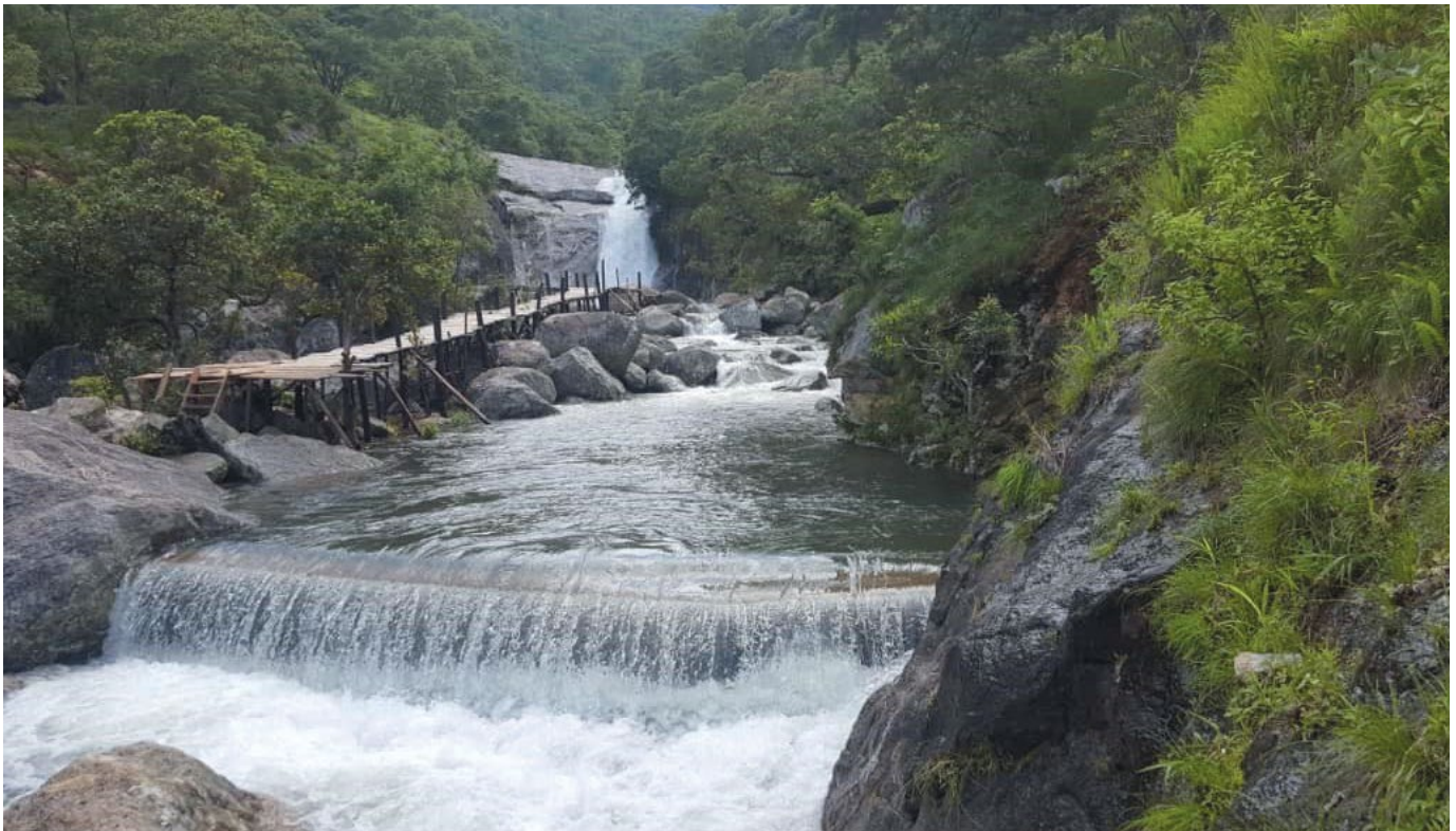
Water intake point on Likhubula River downstream from Dziwe la Nkhalamba.

Compounding these challenges are threats to the ecological health of upstream catchment areas, namely deforestation, invasive plant species, land use conversion, and unsustainable farming practices. This degradation of natural infrastructure exacerbates the challenges of managing water supply infrastructure by increasing the