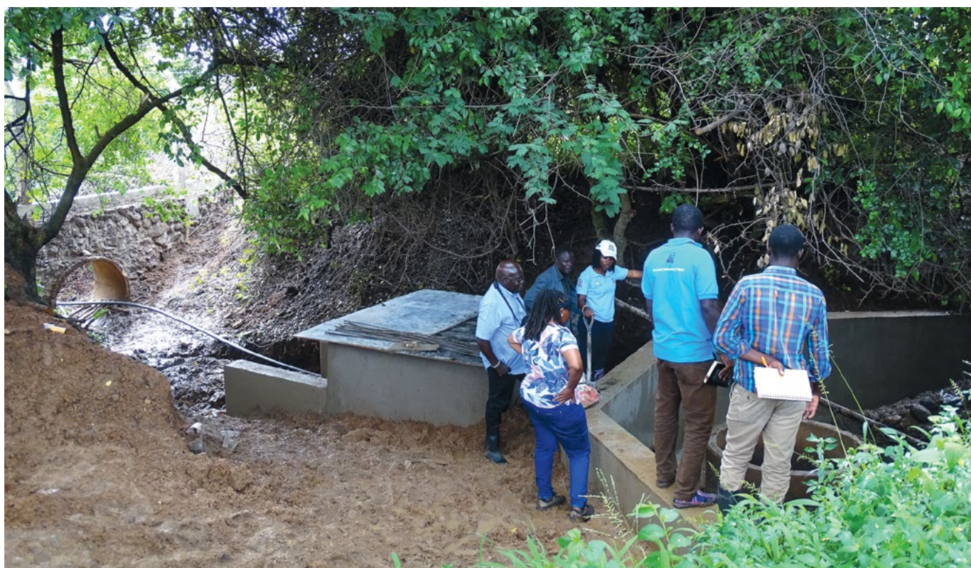
USAID Sustainable Water Partnership staff and local stakeholders inspect a retaining wall at a spring in the Mara Wetlands, Tanzania.

Freshwater springs in the Mara River Basin, however, are severely degraded and can pose health risks to communities that depend on them. A USAID climate vulnerability assessment (CVA) found that approximately 20% of the residents in the Nyangores subcatchment in Kenya collect water from unprotected wells and springs. The assessment also noted that 23% of the households in the Mara Wetlands in Tanzania rely on unprotected