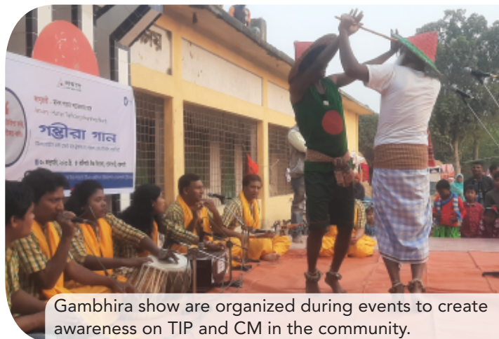
Gambhira show are organized during events to create awareness on TIP and CM in the community.

124 members of the Marriage Registrars' Association are trained