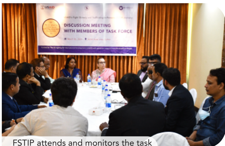
FSTIP attends and monitors the task force meetings on a regular basis.

614 CM victims were provided protection assistance