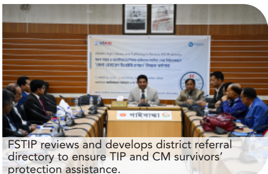
FSTIP reviews and develops district referral directory to ensure TIP and CM survivors' protection assistance.