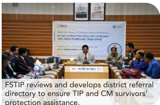
FSTIP reviews and develops district referral directory to ensure TIP and CM survivors' protection assistance.