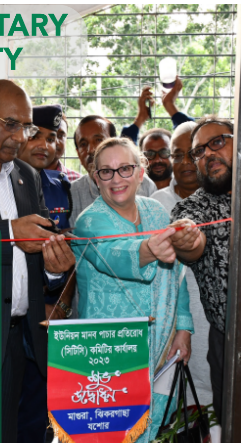
Inauguration of the CTC office at Magura Union, Jashore