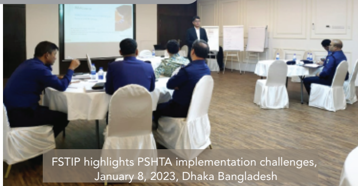
FSTIP highlights PSHTA implementation challenges, January 8, 2023, Dhaka Bangladesh