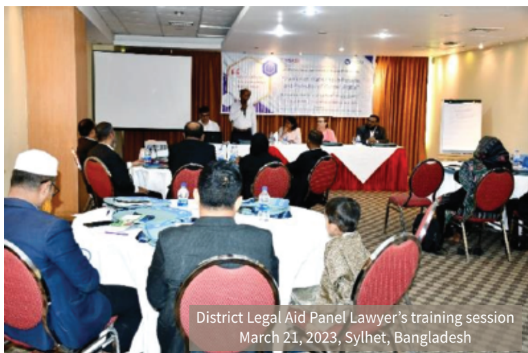
District Legal Aid Panel Lawyer’s training session March 21, 2023, Sylhet, Bangladesh

A group of district legal aid panel lawyers (DLAPL) improved their understanding of the TIP context in Bangladesh the differences between human trafficking and human smuggling, the relevant national legal framework, legal aid in Bangladesh, victims’ rights, and protection after receiving a training by USAID’s FSTIP Activity. The training also enhanced their abilities to support victims of trafficking (VoT), improve VoTs’ access to justice, expedite prosecution of traffickers, and dismissal of TIP cases.