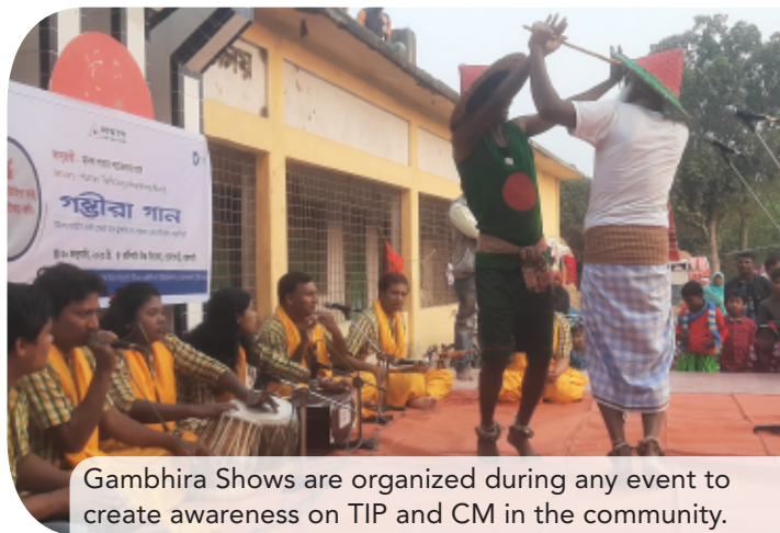
Gambhira Shows are organized during any event to create awareness on TIP and CM in the community.

73 members of the Marriage Registrars' Association are trained