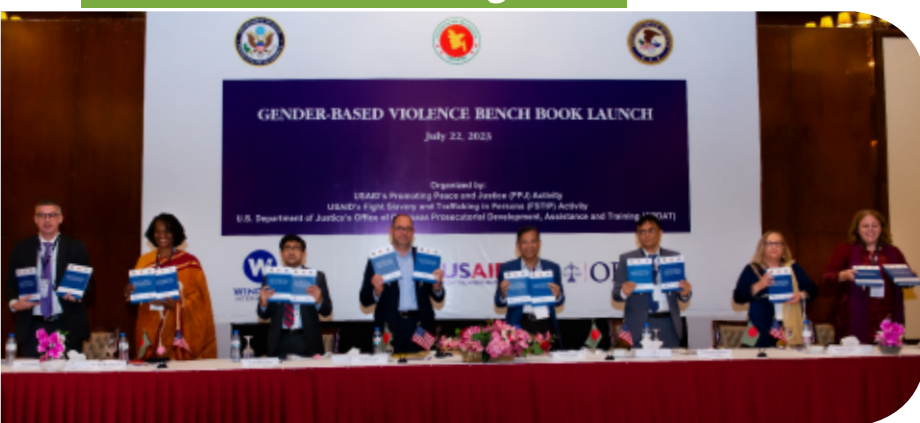
The Minister of Law, Justice and Parliamentary Affairs Mr. Anisul Haque, MP and U.S. Ambassador to Bangladesh Mr. Peter Haas and other dignitaries displaying GBV Benchbook during the launching event on July 22, 2023

FSTIP developed a Gender-based Violence (GBV) bench book (a practical manual) for judges who adjudicate GBV cases. FSTIP worked jointly with Office of Overseas Prosecutorial Development, Assistance and Training (OPDAT) and USAID’s Promoting Peace and Justice (PPJ) project to develop this practical manual and included sections on a victim-sensitive approach to GBV cases, principles of a fair trial in GBV cases, and resources available to GBV victims in Bangladesh. The objective of the bench book is to support the judiciary in applying the existing legal frameworks related to GBV crimes, both substantively and procedurally, in a manner that is expeditious, uniform, and in line with the established precedent and international conventions to which Bangladesh is a party.