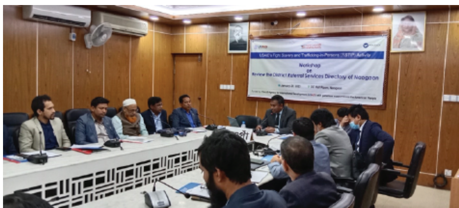
Naogaon Deputy Commissioner presiding over the workshop on updating the district referral directory

FSTIP, in collaboration with district administrations, updated eight referral directories in Barishal, Chapainawabganj, Cox's Bazar, Joypurhat, Khulna, Lalmonirhat, Naogaon and Sirajganj, and developed four new referral directories in Bagerhat, Gaibandha, Jhenaidah and Narayanganj. In addition to the Deputy Commissioners (DC), 428 (Female 83 & Male 345) government and non-government service providers