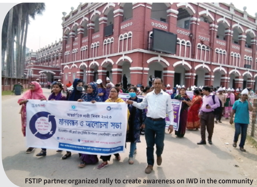
FSTIP partner organized rally to create awareness on IWD in the community

The FSTIP activity organized a series of events as part of its International Women's Day 2023 campaign to express solidarity with the theme of the day – DigitALL: Innovation and Technology for Gender Equality (Digital Projukti O Udvaban, Gender Boishammo Karbe Niroshan) . The activities featured various events including the colorful rallies and human chains, debate competition, bi-cycle rally and community meeting, which attracted more than 3,000 participants who learned about how to effectively use technology to promote their work and to protect themselves from various forms of cyber violence and how people defraud other to ensnare human trafficking and child marriage through digital technology.