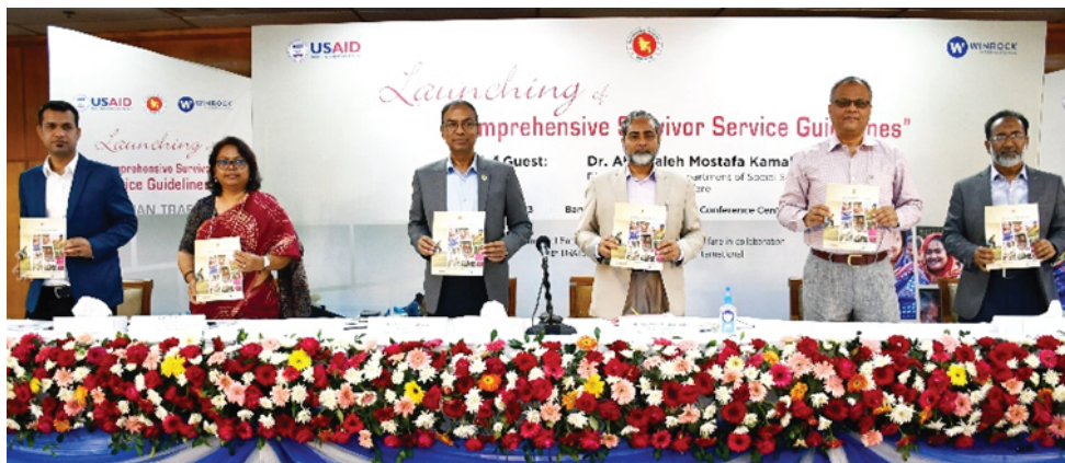
Dignitaries displaying CSS guidelines during the unveiling session on March 30, 2023, Dhaka