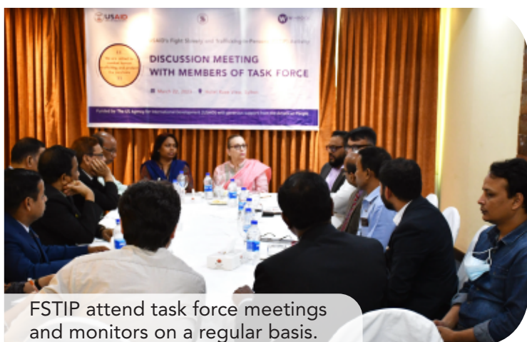
FSTIP attend task force meetings and monitors on a regular basis.

420 CM victims provided protection assistance